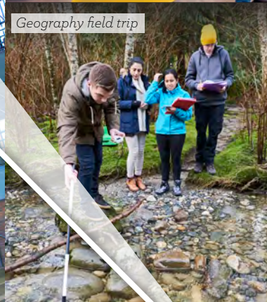
Geography field trip