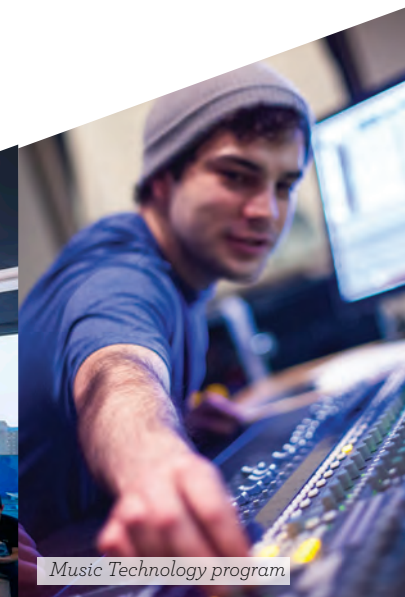
Music Technology program