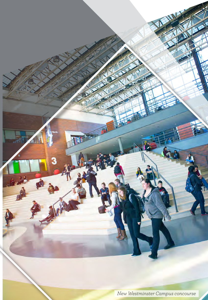
New Westminster Campus concourse

Our campuses offer plenty of spaces for quiet study, collaboration on group projects, fitness, fun activities, hands-on learning and more.