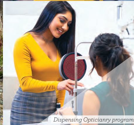
Dispensing Opticianry program