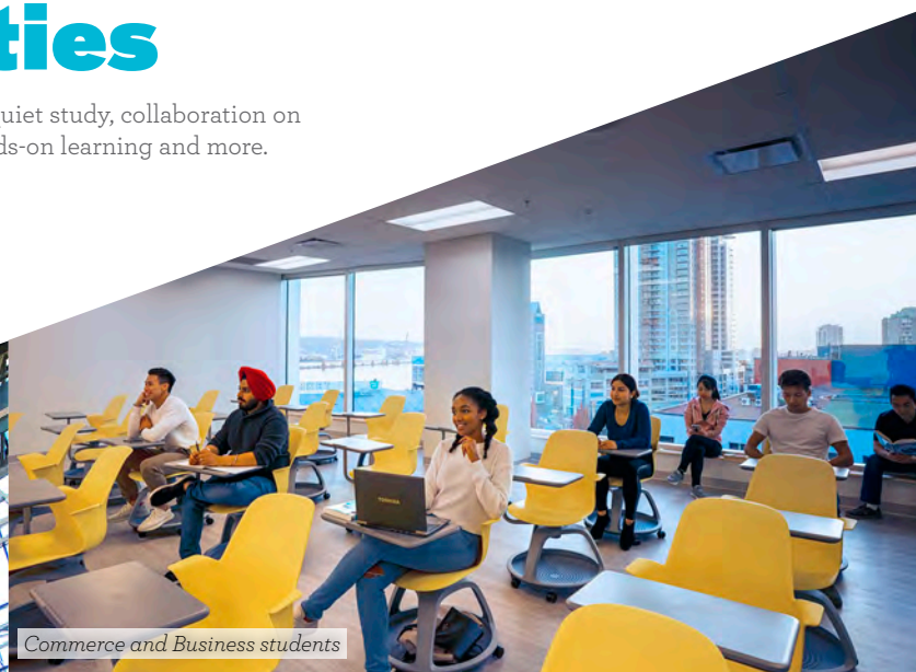
Commerce and Business students