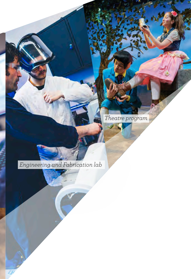
Engineering and Fabrication lab