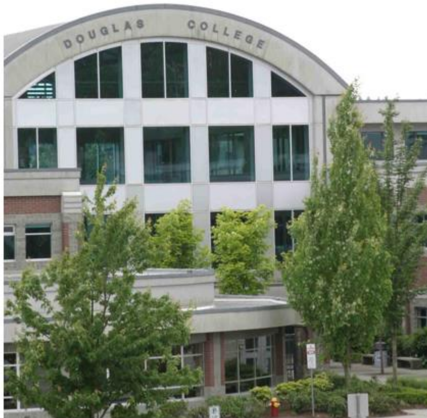
Douglas College Bachelor of Science in Nursing Program

Prepared for the College of Registered Nurses of British Columbia Education Program Review Committee